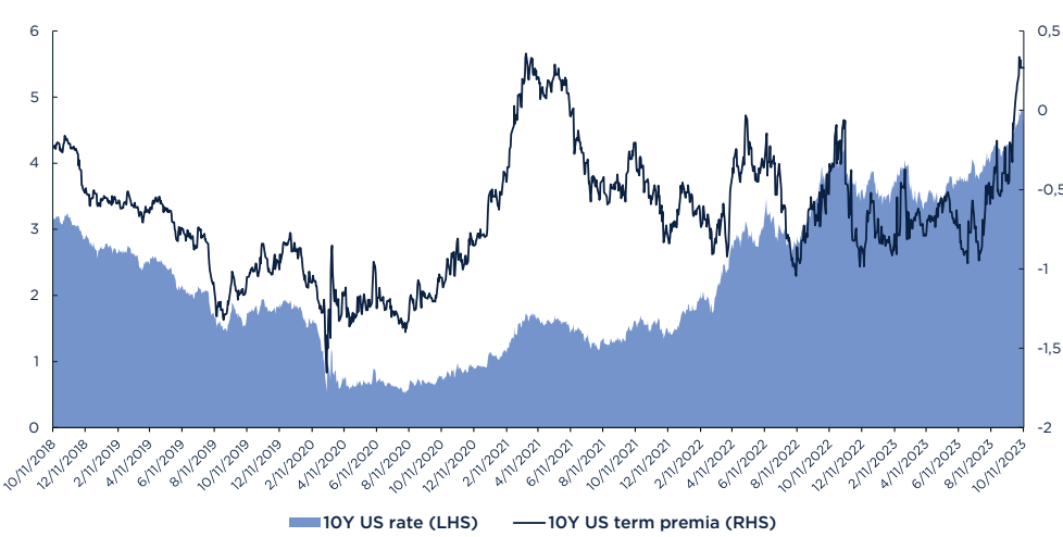
Source: Bloomberg. Edmond de Rothschild Asset Management. Data as at 11/10/2023.

movements are usually unrelated to monetary policy expectations and the idea that higher long bond yields are due to a crisis brewing over US deficit funding is contradicted by the dollar's strong performance.